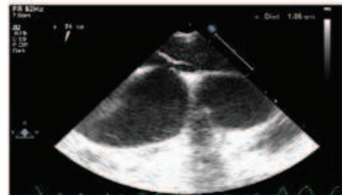
Long Tunnel PFO

An echocardiogram and chest x-ray showed the device in correct position at the 24 hour follow up, and the patient was discharged.